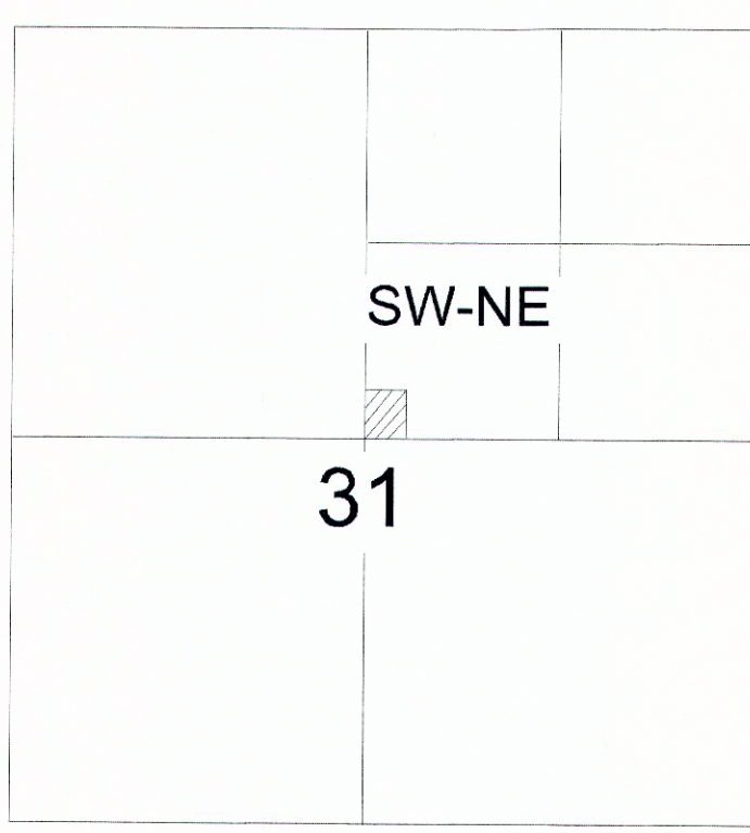
VICINITY MAP RANGE 10 EAST

PARCEL 1 DESCRIPTION OF A PARCEL OF LAND IN CARBON COUNTY, UTAH WHICH IS LOCATED IN THE SOUTHWEST QUARTER OF THE NORTHEAST QUARTER OF SECTION 31, TOWNSHIP 13 SOUTH, RANGE 10 EAST, SALT LAKE BASE AND MERIDIAN DESCRIBED AS FOLLOWS: BEGINNING AT A POINT WHICH LIES SOUTH 89°05'23" WEST, 1324.85 FEET FROM THE SOUTHEAST CORNER OF THE SOUTHWEST QUARTER OF THE NORTHEAST QUARTER OF SAID SECTION 31 AND RUNNING NORTH 89°05'23" EAST, 121.34 FEET, THENCE NORTH 1°20'00" WEST, 188.01 FEET; THENCE SOUTH 89°05'23" WEST, 118.18 FEET; THENCE SOUTH 0°22'14" EAST, 188.01 FEET TO THE POINT OF BEGINNING, CONTAINING 0.517 ACRES MORE OR LESS. SUBJECT TO RESERVATIONS AND RESTRICTIONS OF RECORD AND RIGHT OF WAYS AND EASEMENTS EVIDENCED.