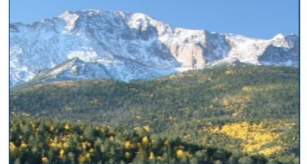
Famous Pikes Peak - America's Mountain