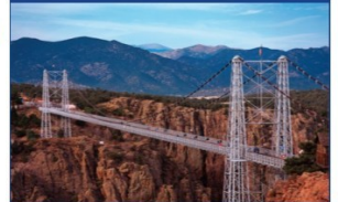
Visit to the Royal Gorge Bridge and Park