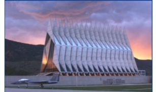
Visit to the U.S. Air Force Academy